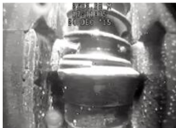
Inspection of control stabs in a tubing hanger prior to coupling Gas lift mandrel inspection