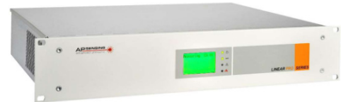
19" Rack Mount