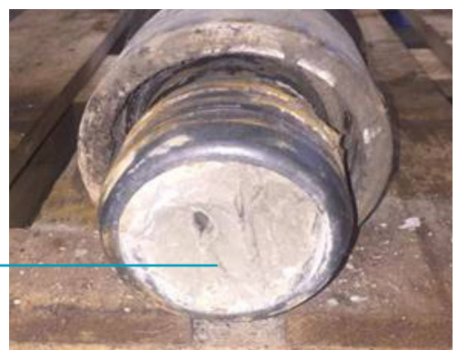
Cement sample recovered from beneath the latch in adapter ball seat of the SeaCure® system. A qualitative but definitive example of cement quality at the shoe.